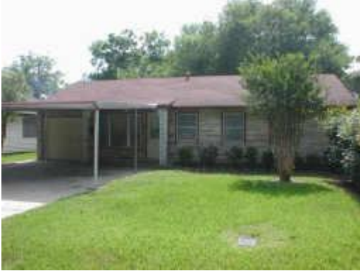
This is a Great House & so close to everything!