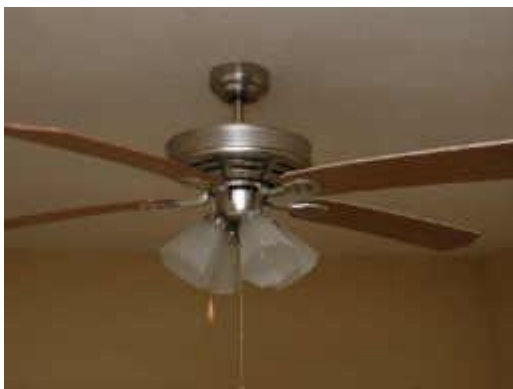
New ceiling fans, new light fixtures.