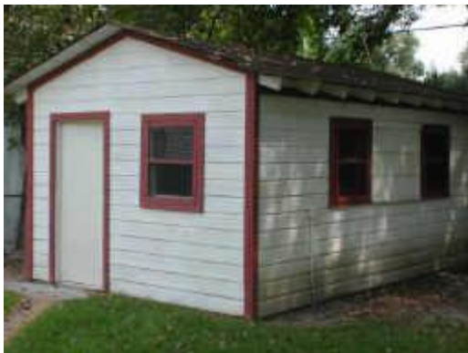
Workshop in backyard could be converted to an efficiency apartment!