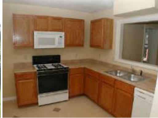
Kitchen is all new, light & bright.