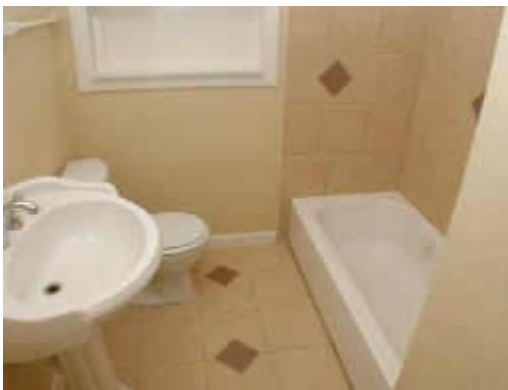
Full bath is all new, new sink, new commode, new tub, new tile!