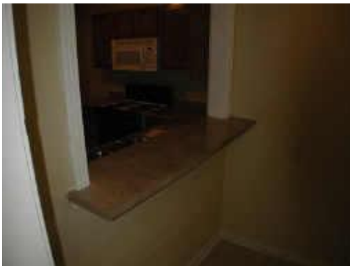
Breakfast nook has counter overhang from kitchen.