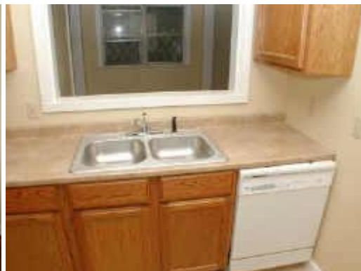
Totally modern kitchen, plenty of storage space.