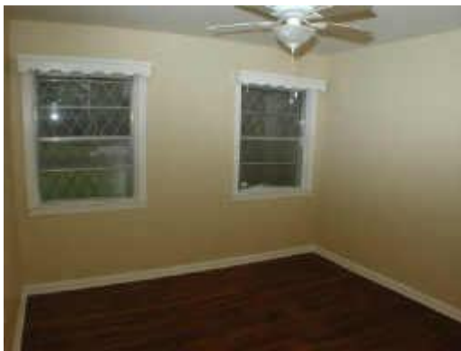
All bedrooms are very nicely sized.

large table, plus china cabinets, plus a sofa!