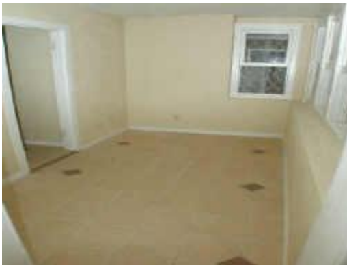
Great little Sunroom, can be used as a Sewing Room, Home Office, Homework Room, or Poker Room!