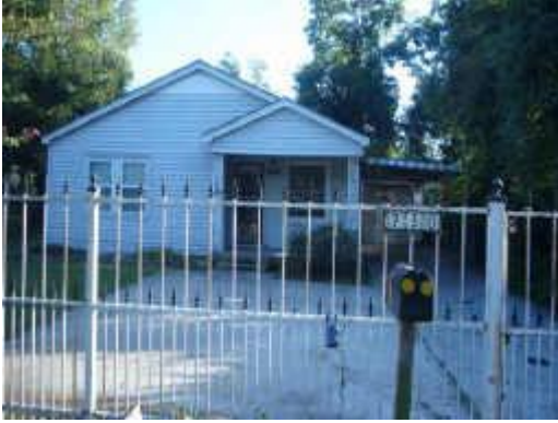
FRONT OF THE HOUSE