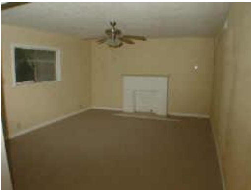
Family Room has plenty of space for a big TV and seating.