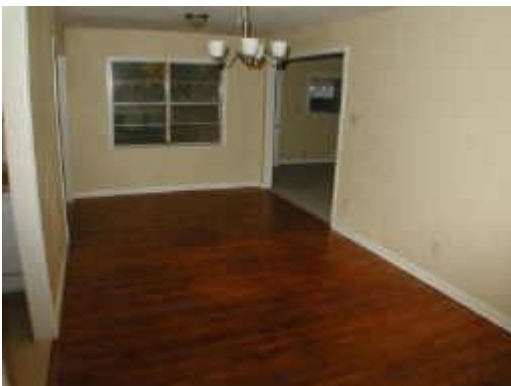
Dining Room is Large! Plenty of space for a very