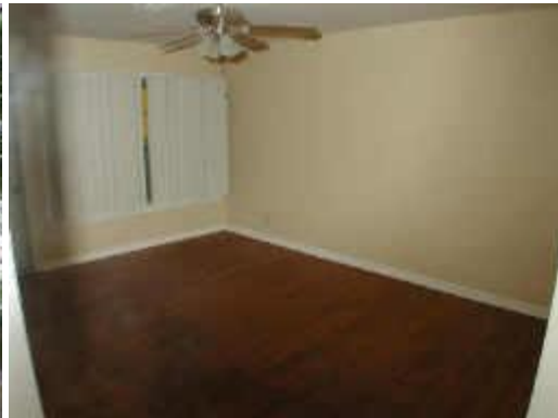
Front Room/Living Room.