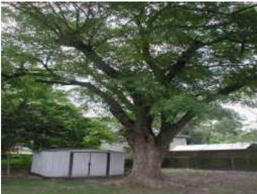
Storage shed for all that yard stuff...no need to clutter up the garage or workshop. And, back yard is plenty big enough for the kids to play.