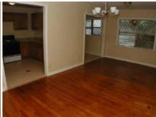
Dining Room looking into kitchen.