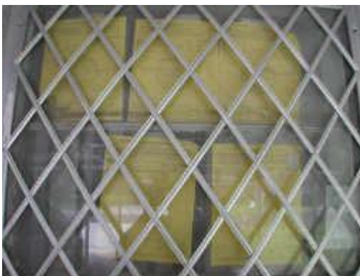
All the remodeling work has been properly permitted!